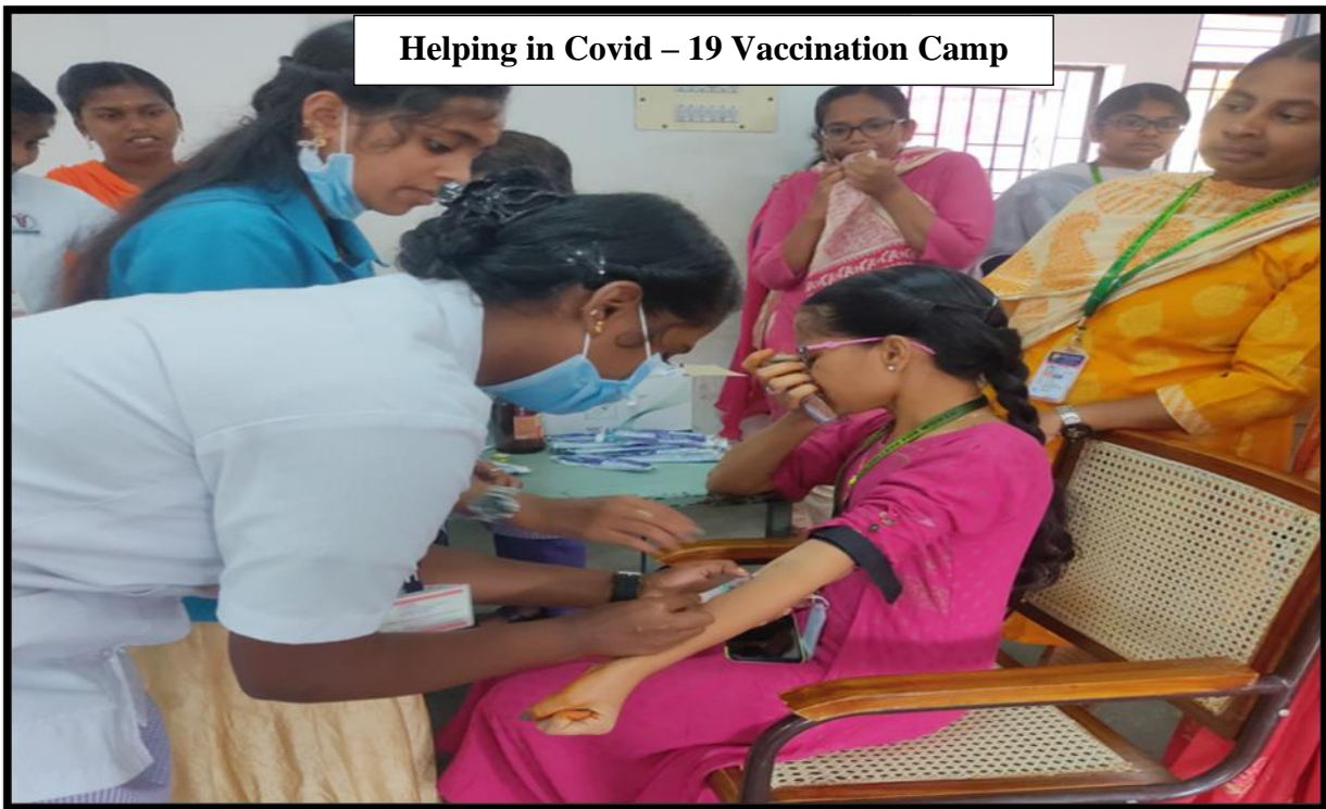
Helping in Covid – 19 Vaccination Camp